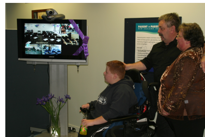
17 June 2011

Disability Studies: Every Body In Inaugural Conference, 27-30 November 2011